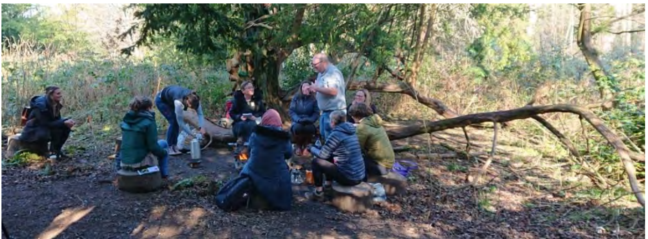
Exploring a Wild Ways Well session