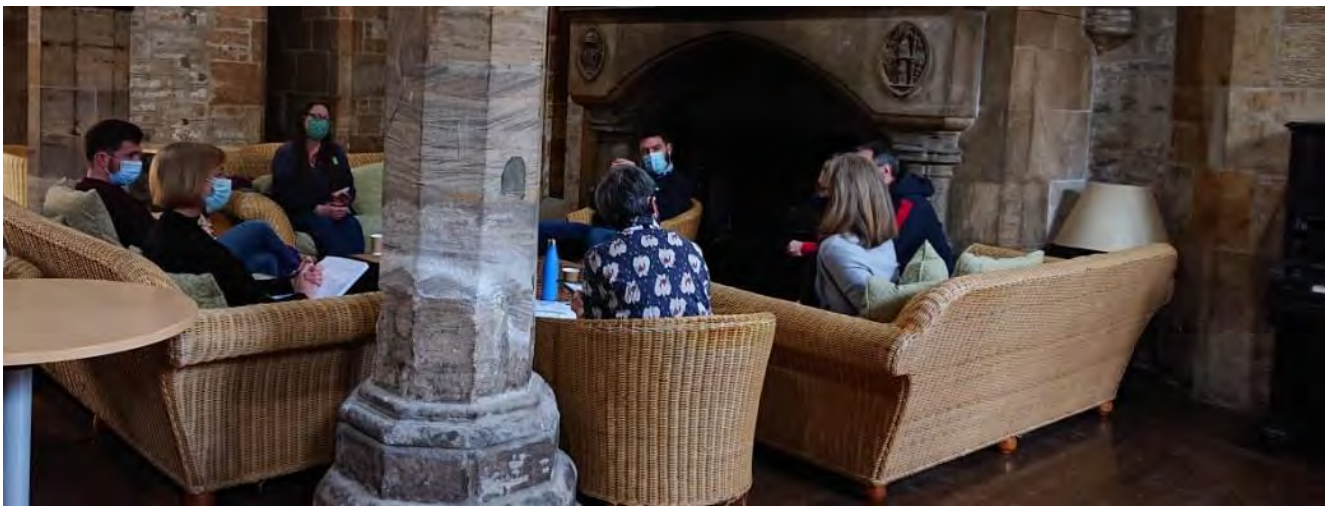
Discussing the golden threads of the green prescribing strategies